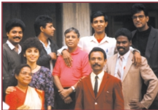
BTCL class in India