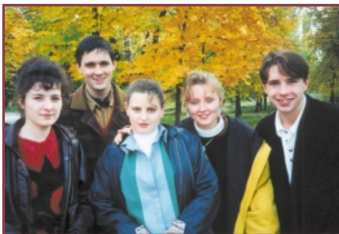
Students in the Ukraine

Tagalog (Philippines) Tamil (India) Telegu (India) Thai Vietnamese Zulu (South Africa)